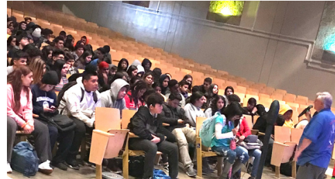
Planting Lunch Time Assemblies in Every High School