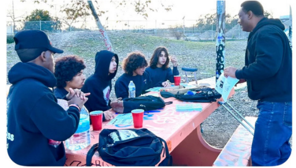
Outreach to Local SkateBoard Park taking pizza and Explaining the Gospel