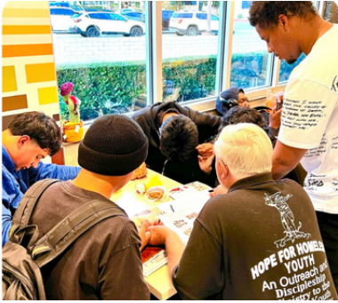
Praying and clearly explaining the gospel to every student

We are excited to share our success stories: 5,466 converts have received Jesus, 221 have been baptized, and we've distributed 5,000 Bibles. Our goal is to reach every high school in America.