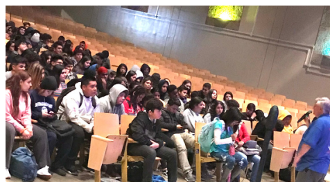
Planting Lunch Time Assemblies in Every High School