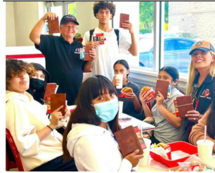
Distributing 30,000 bibles