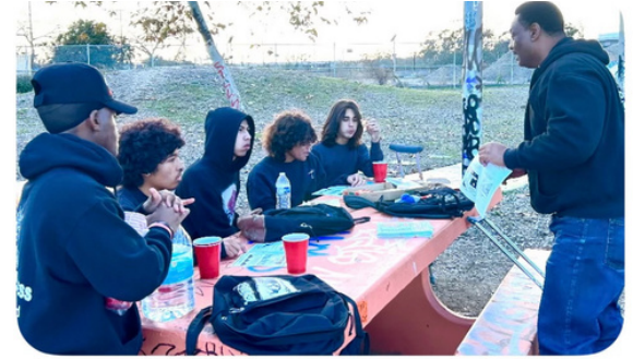
Outreach to Local SkateBoard Park taking pizza and Explaining the Gospel